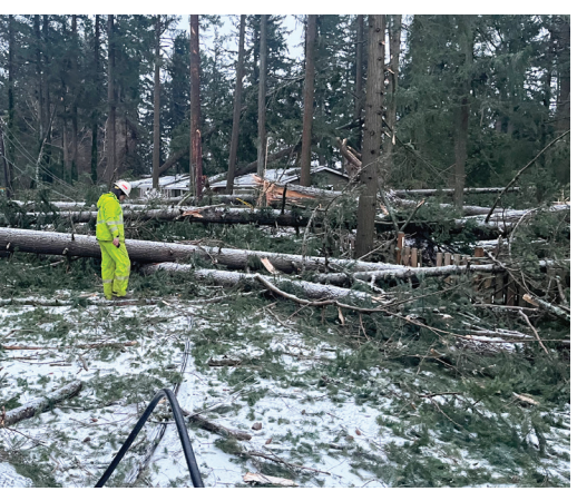
A NW Natural employee assesses fallen trees, snow, ice, and de-energized power lines.

The winter storm in mid-January led to record demand and use of natural gas. We are glad to have helped customers—including many who had lost power—stay comfortable and warm during the storm.