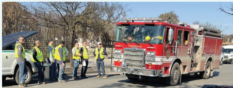
NW Natural crews and Portland firefighters team up for SoCalGas customers.

You, too, can adopt best safety practices! How? Check out the tips we recommend most, from calling 811 before digging to perfecting safe outdoor grilling habits.