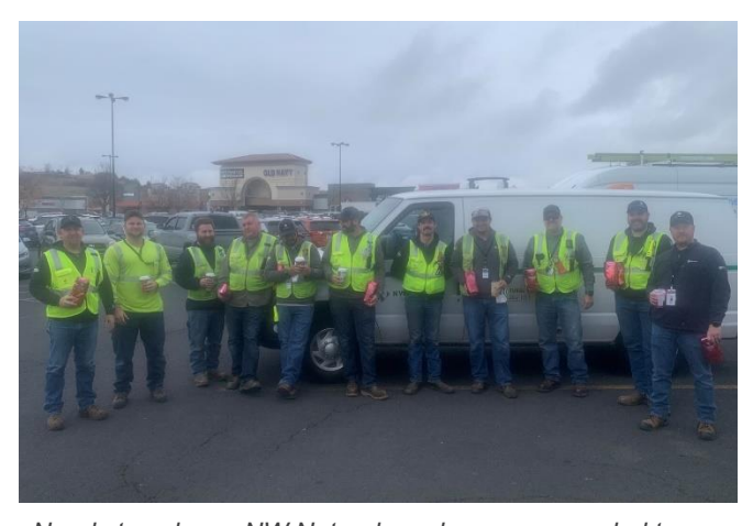
Nearly two dozen NW Natural employees responded to an Avista system outage.

Relight areas were sorted into zones, with completion goals for each. Customers received a robocall with an expected arrival time for a tech, and goals were updated daily – allowing techs to see their success on a daily basis.